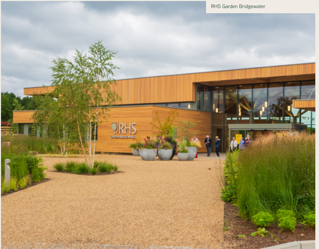
RHS Garden Bridgewater