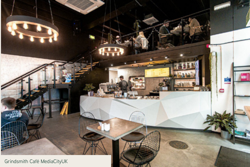
Grindsmith Café MediaCityUK